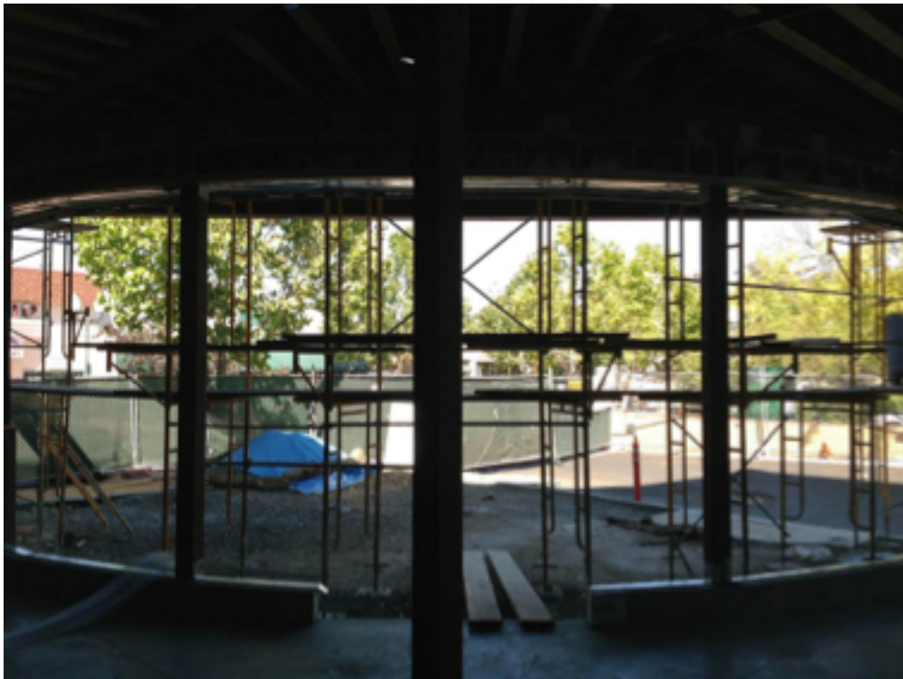
005 Interior at Suite C.Photo 1