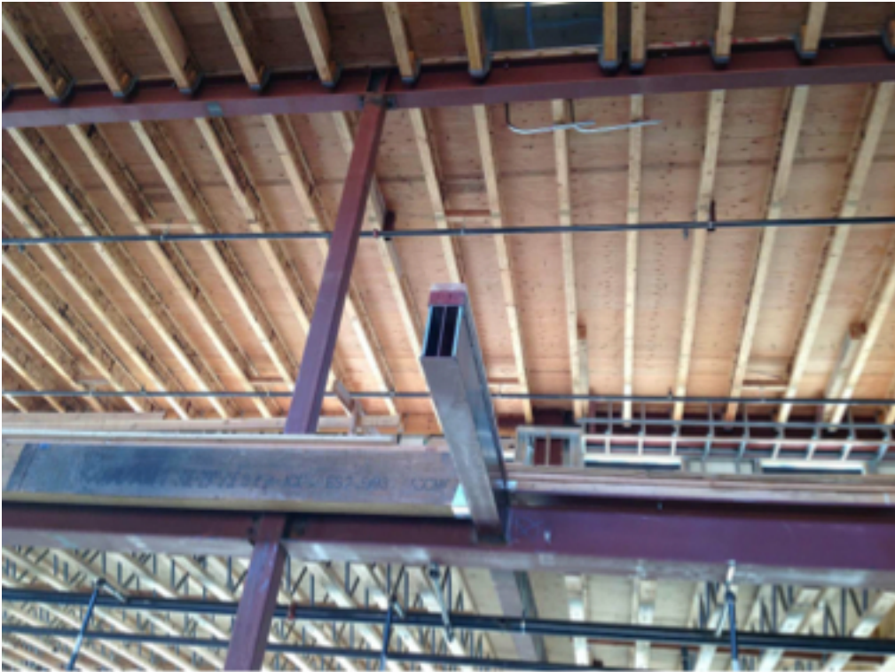
008 Interior at Suite D.Photo 2