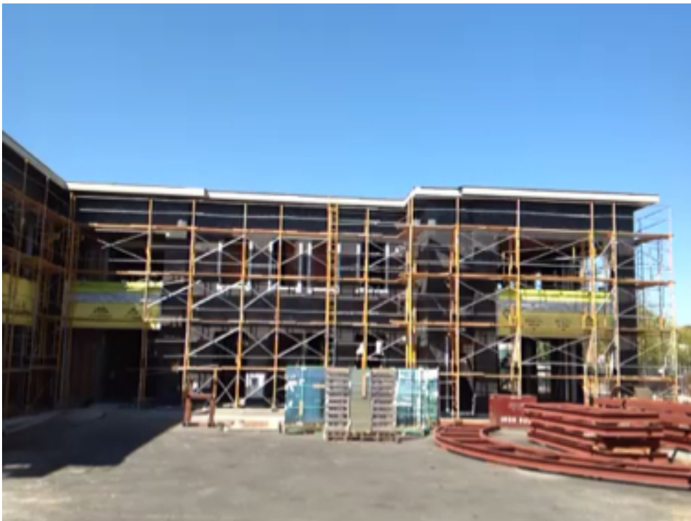
004 Southwest Ext. Elev..Video 2