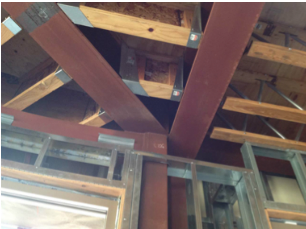
010 Tenant Space 1.Photo 3