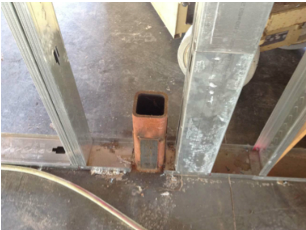
003 Fire Exit Stairs.Photo 3