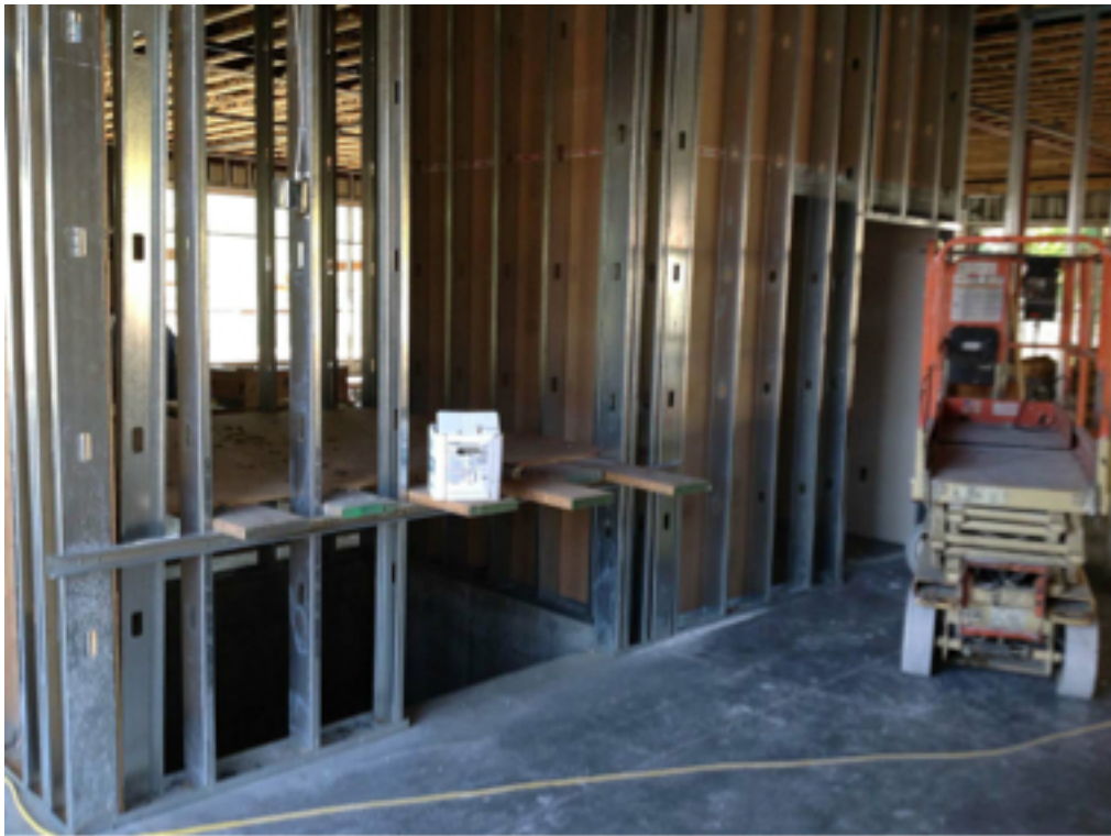
009 Lobby elevator.Photo 1