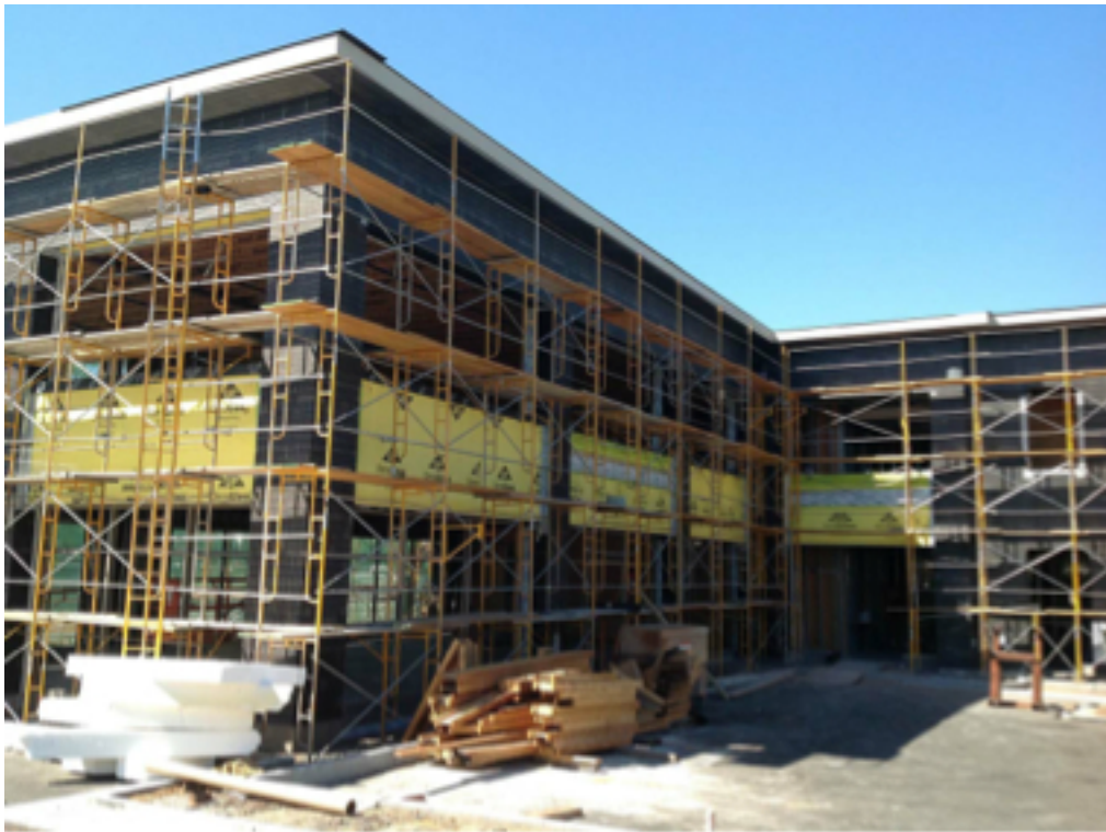
004 Southwest Ext. Elev..Photo 1