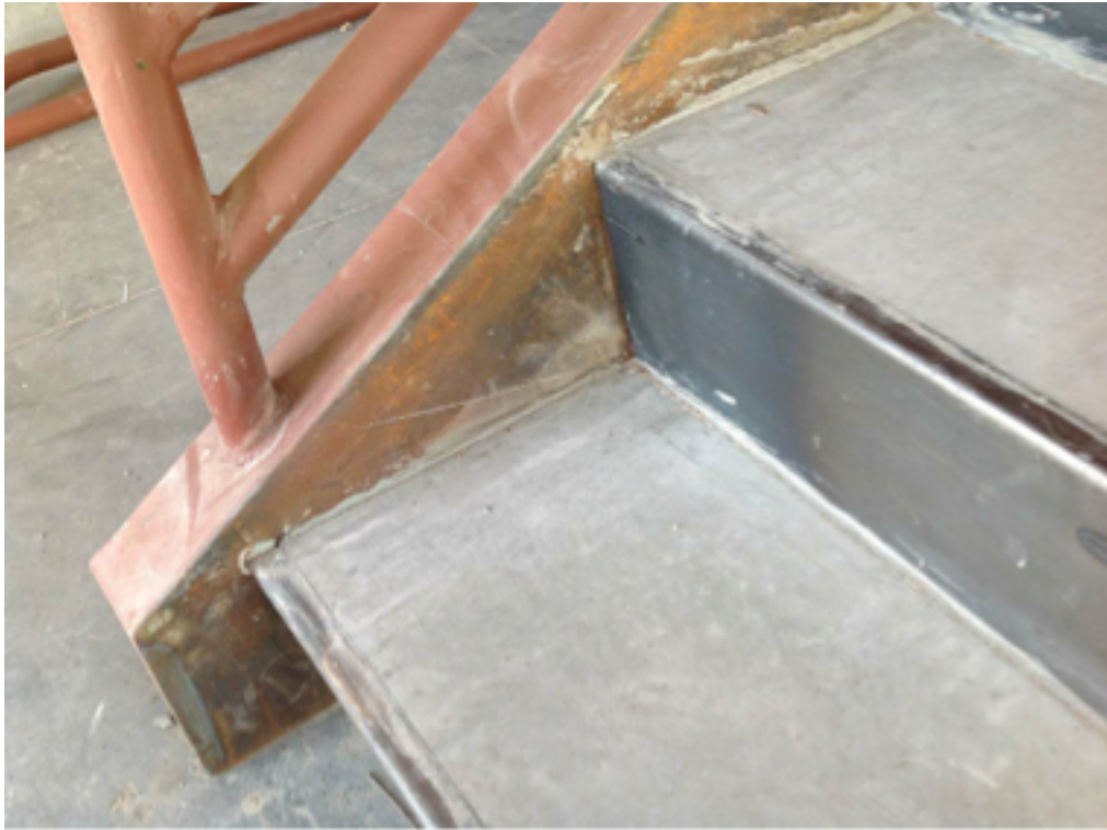
003 Fire Exit Stairs.Photo 4