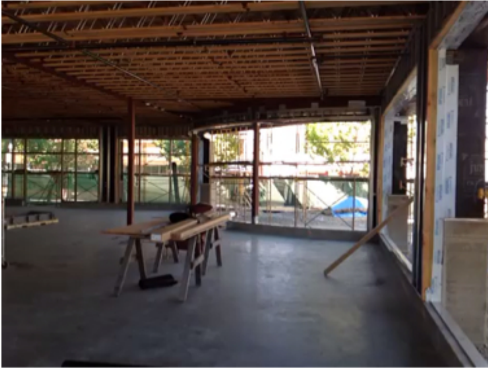
003 Fire Exit Stairs.Video 1