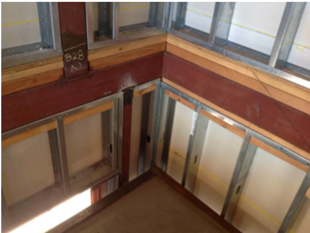
003 Fire Exit Stairs.Photo 5