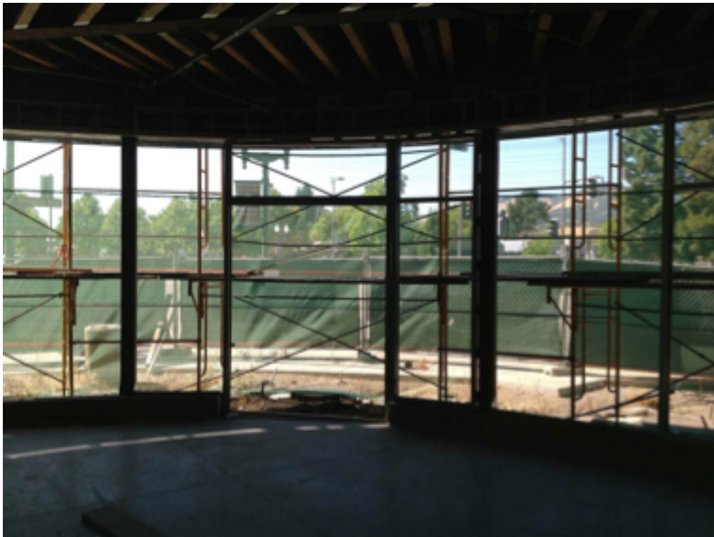
010 Tenant Space 1.Photo 1