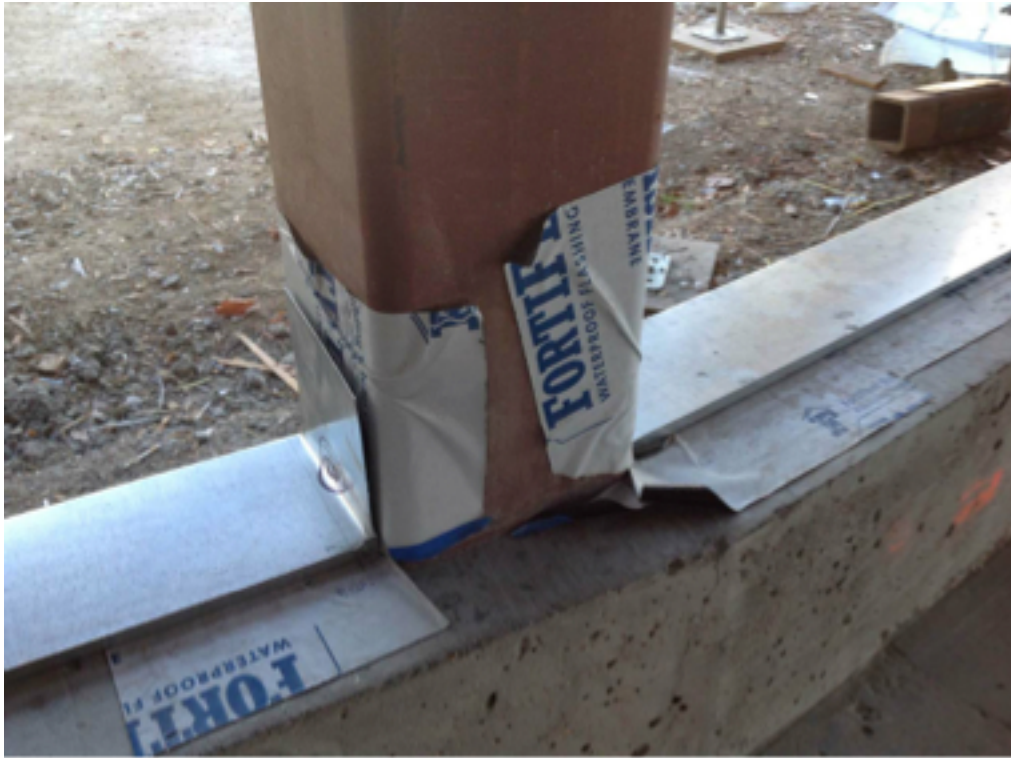
005 Interior at Suite C.Photo 2