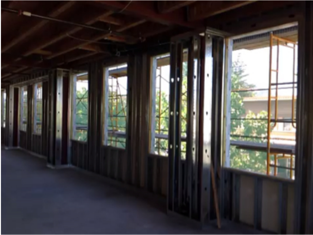
010 Tenant Space 1.Video 1