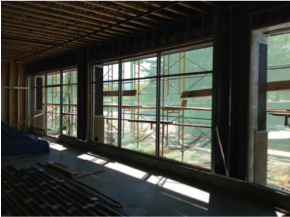
010 Tenant Space 1.Photo 2