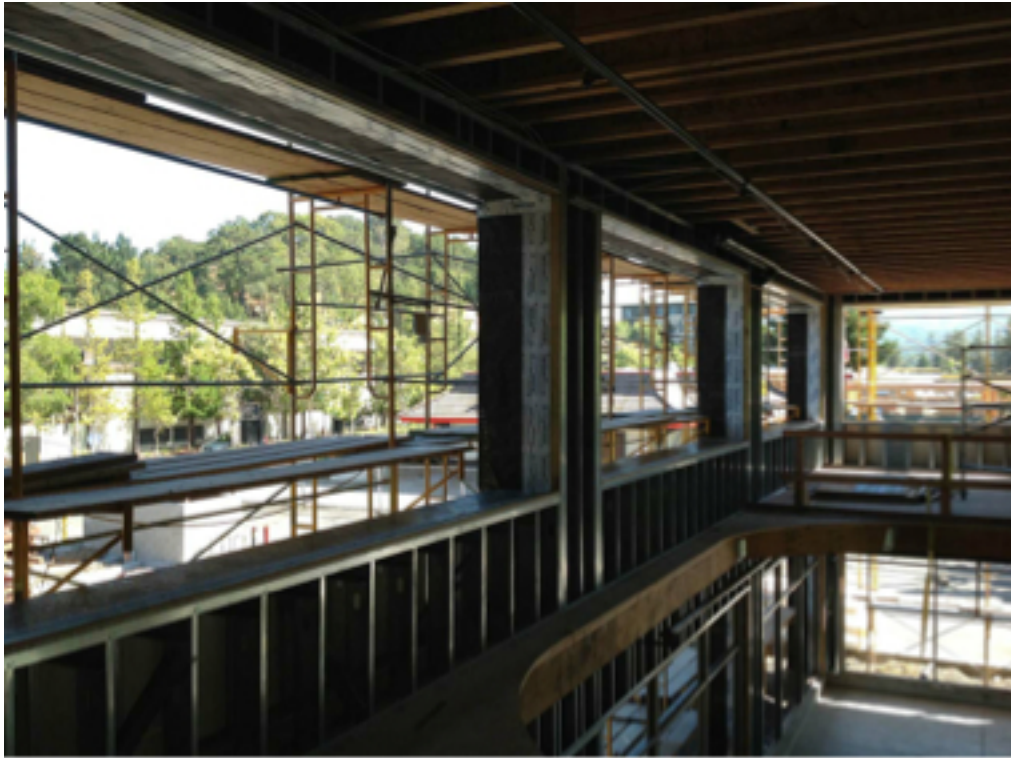
008 Interior at Suite D.Photo 6