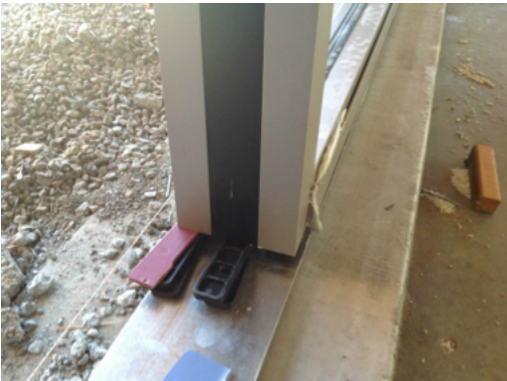
008 Interior at Suite D.Photo 3