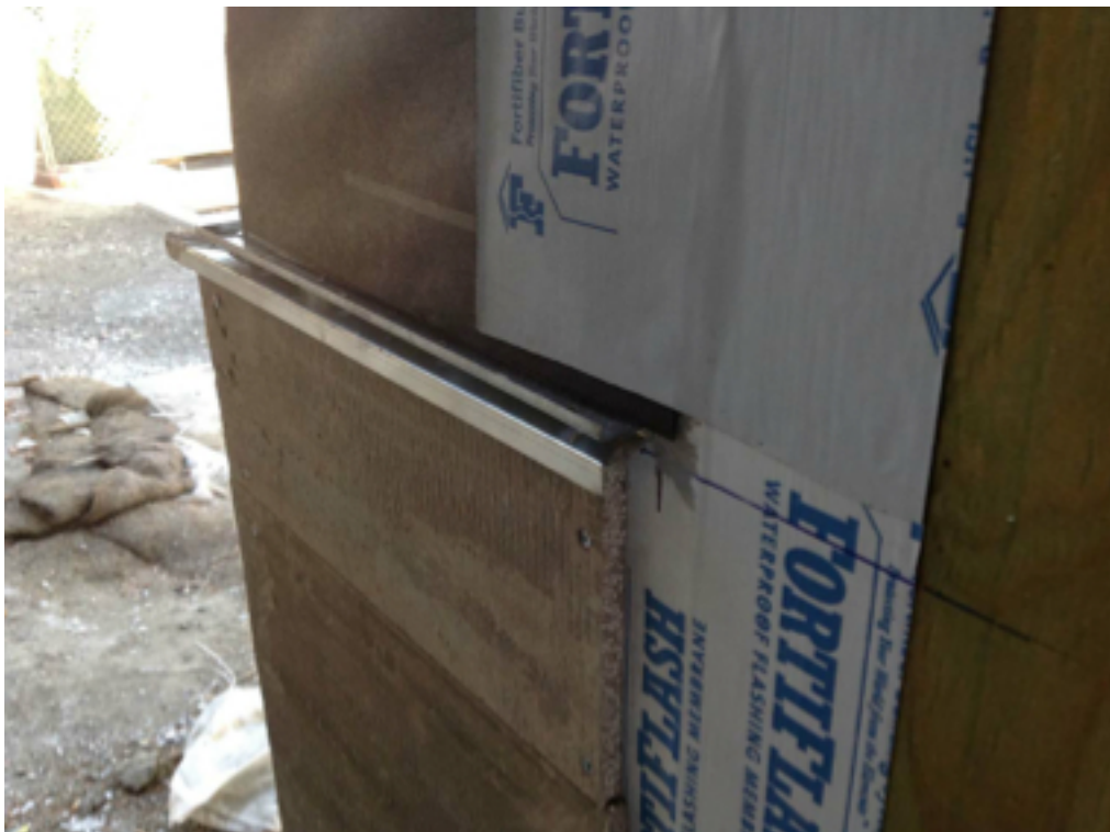
005 Interior at Suite C.Photo 3