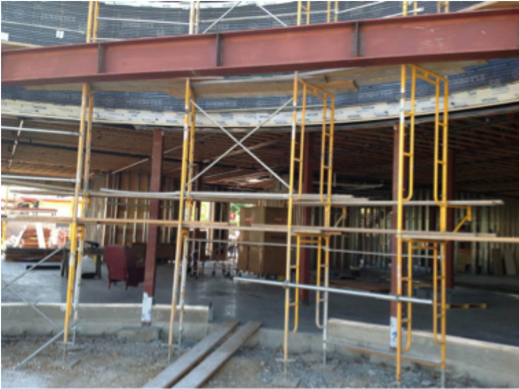
002 Project Main Entry.Photo 2