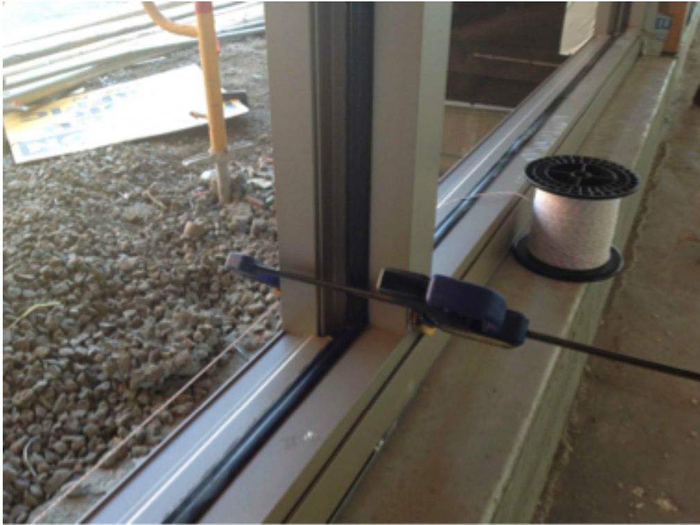
008 Interior at Suite D.Photo 4