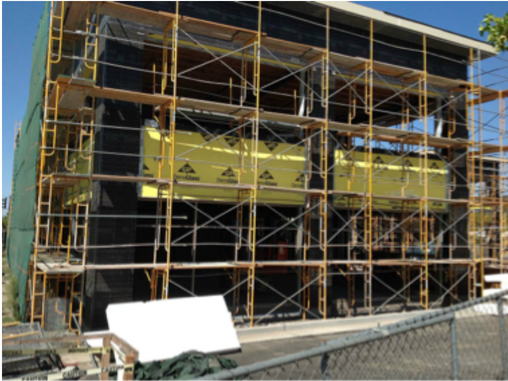
001 Project Example.Photo 2