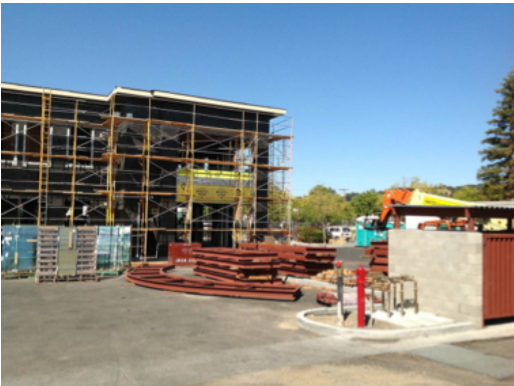
004 Southwest Ext. Elev..Photo 3