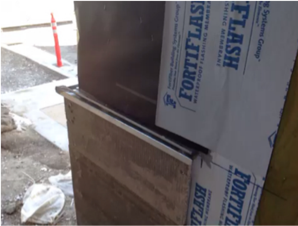
005 Interior at Suite C.Video 1