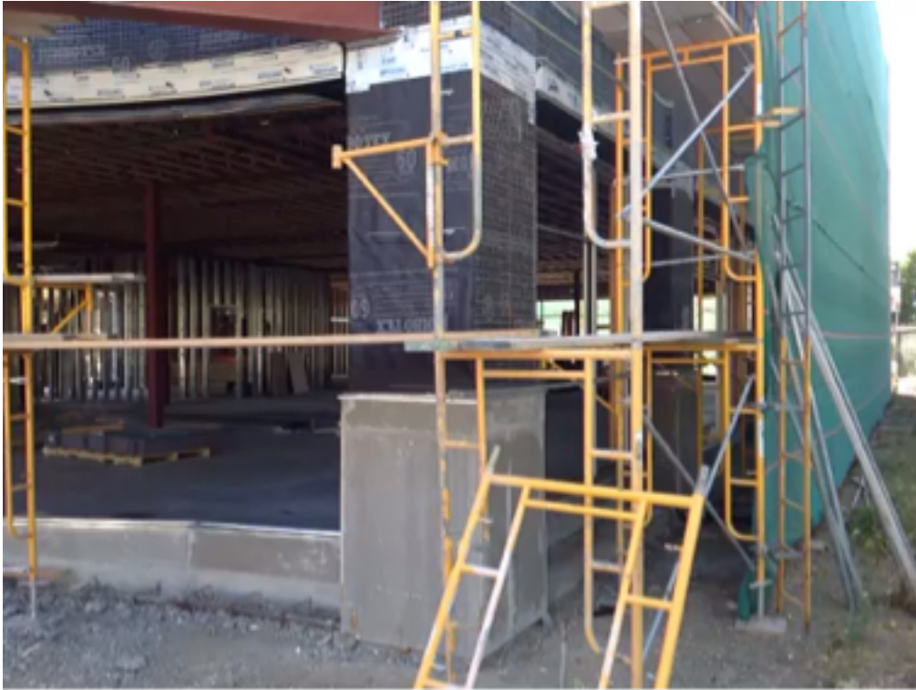
002 Project Main Entry.Video 1