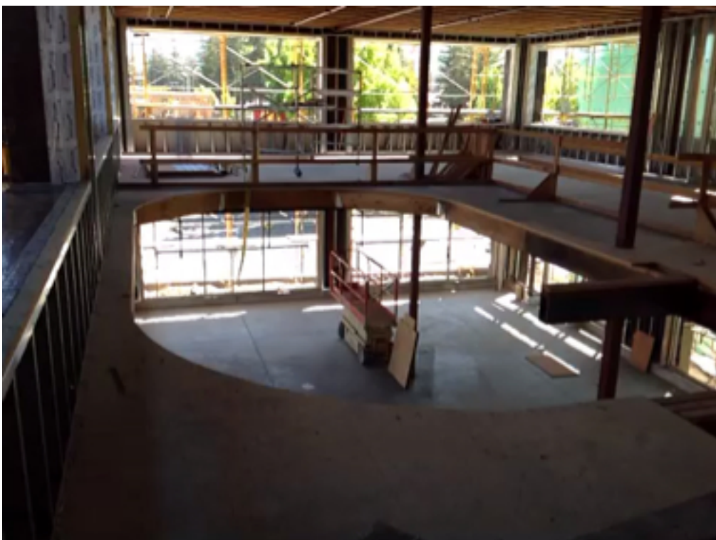
008 Interior at Suite D.Video 2