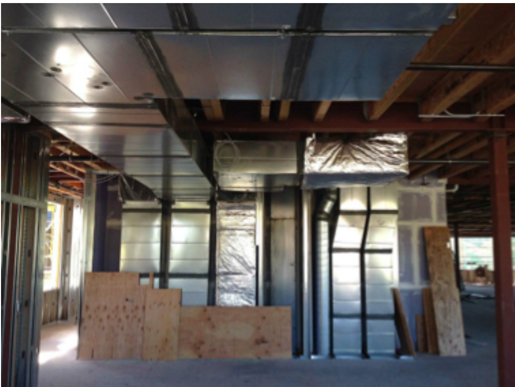
007 Duct Work.Photo 3