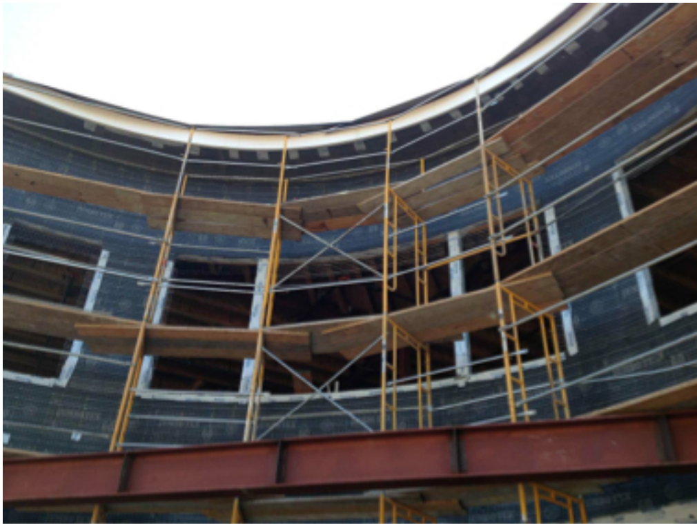
002 Project Main Entry.Photo 1