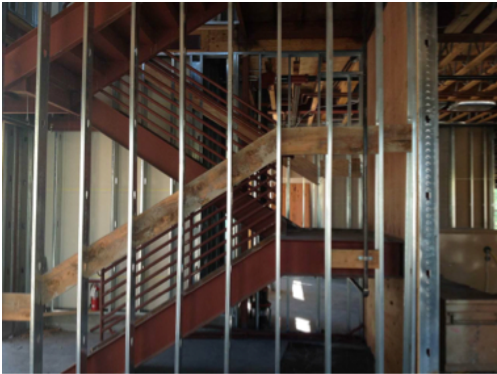
003 Fire Exit Stairs.Photo 1