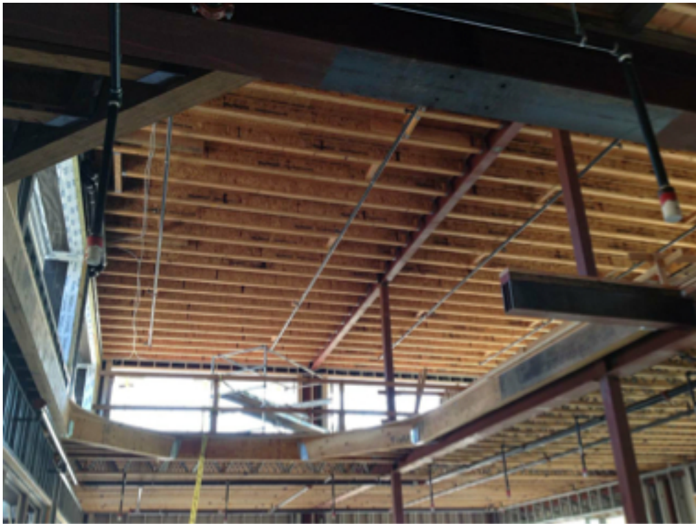
008 Interior at Suite D.Photo 1