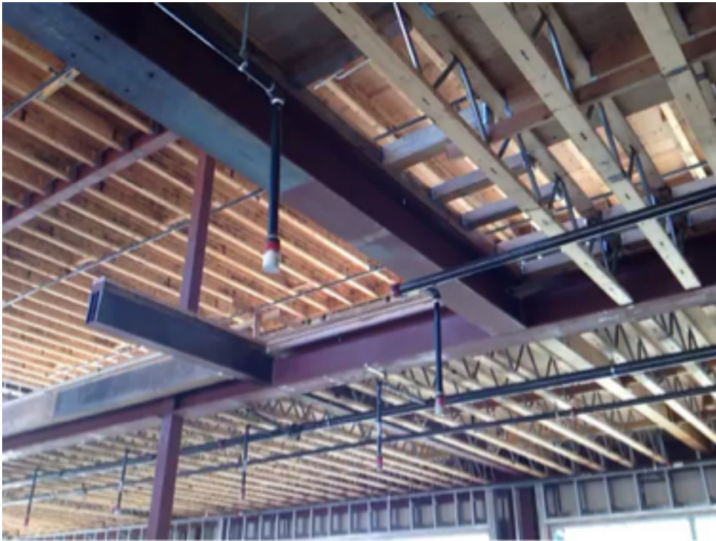
008 Interior at Suite D.Video 1