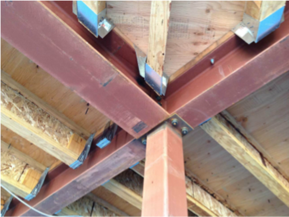
005 Interior at Suite C.Photo 4