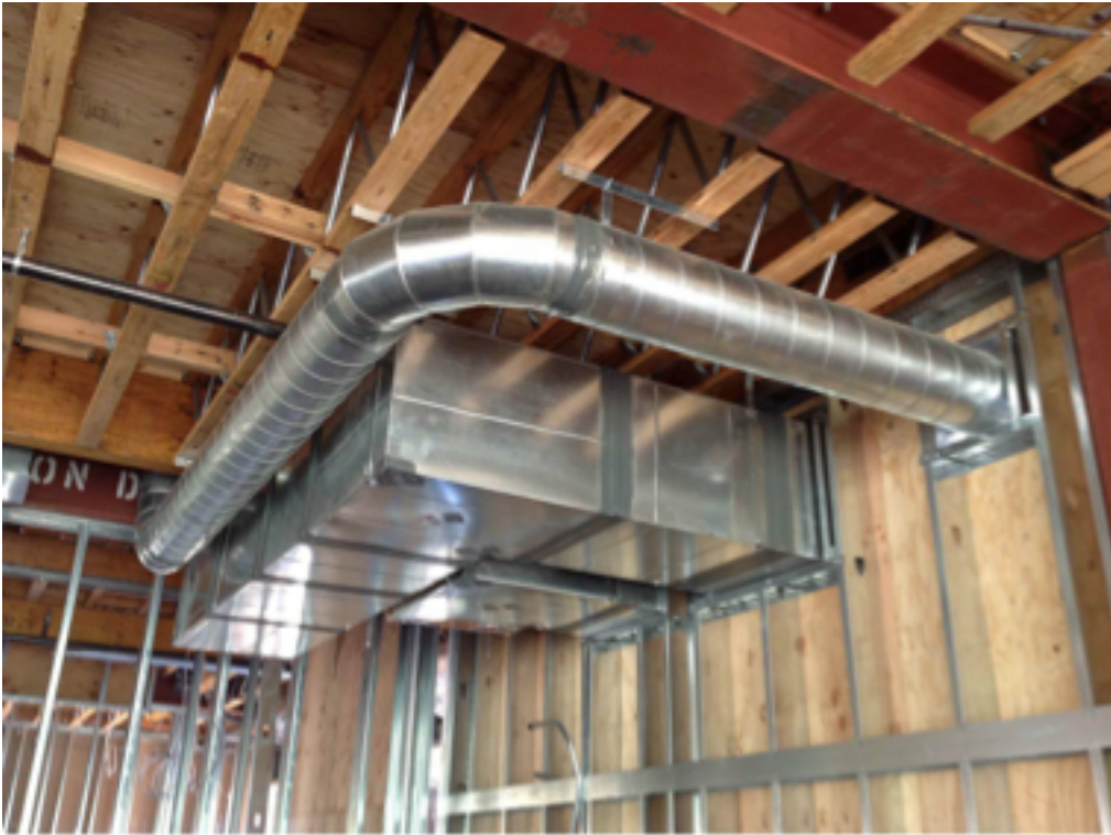
007 Duct Work.Photo 2