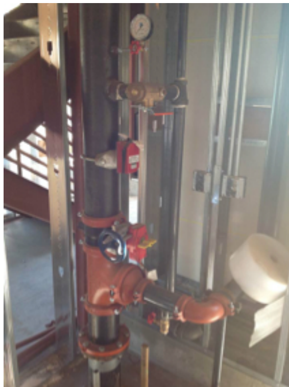
009 Lobby elevator.Photo 3