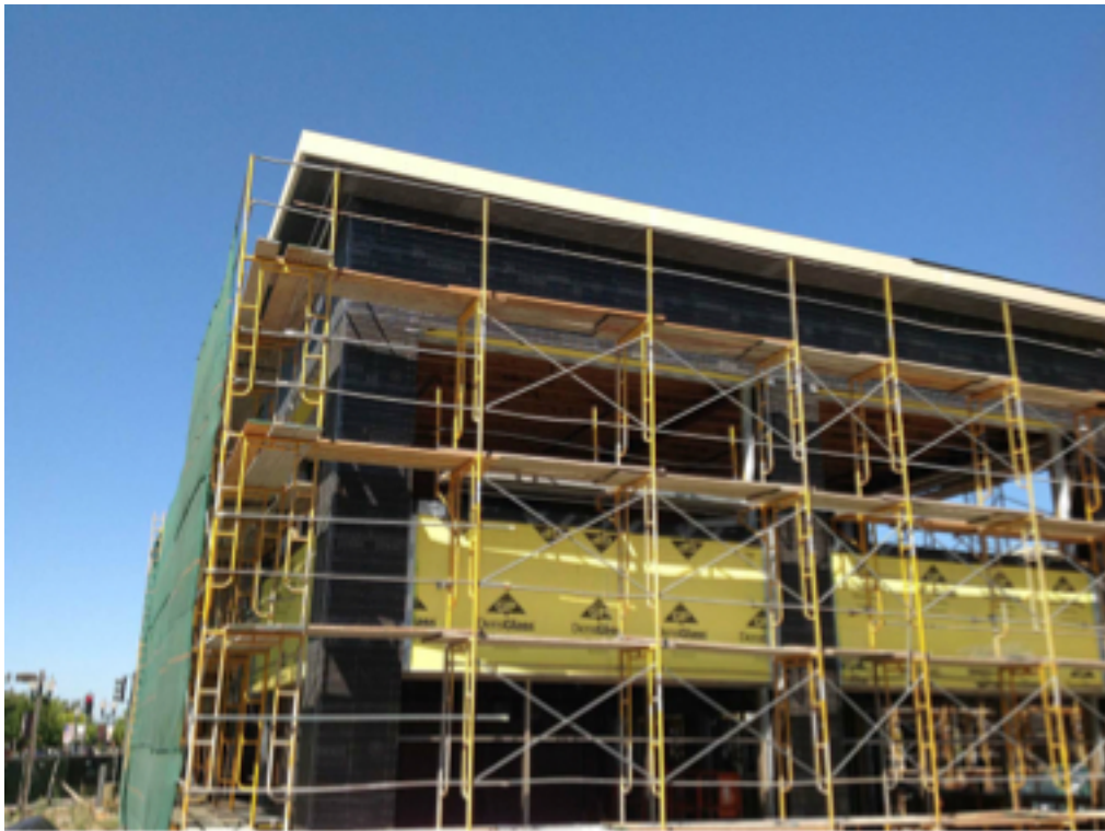
001 Project Example.Photo 1