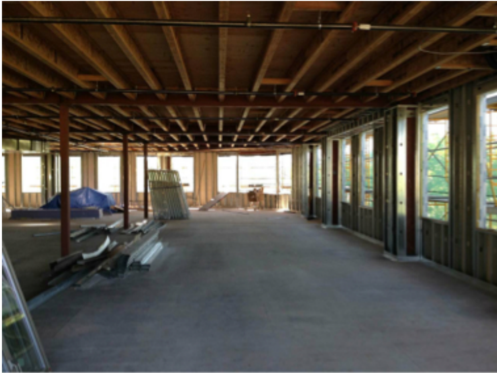
010 Tenant Space 1.Photo 4