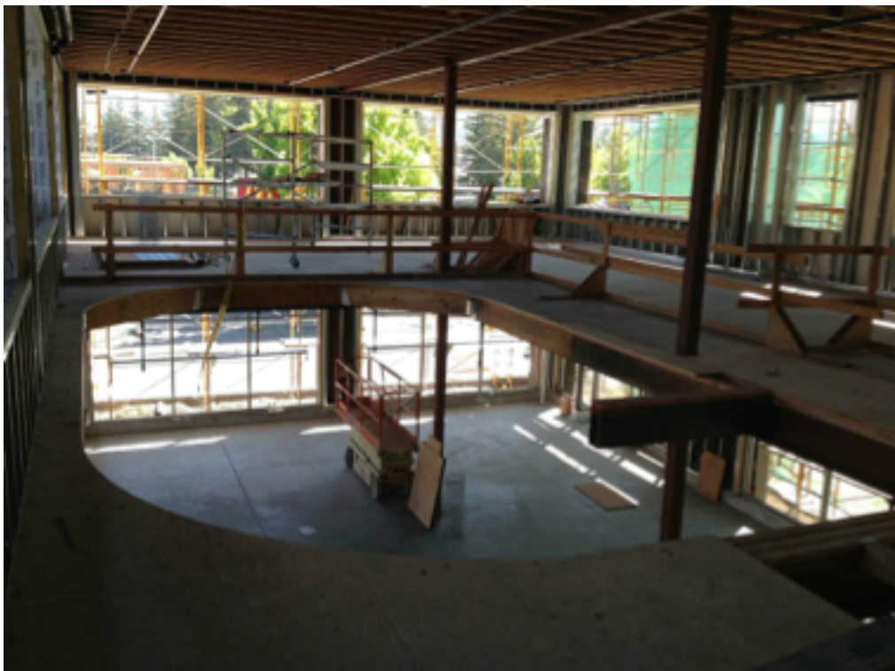
008 Interior at Suite D.Photo 5