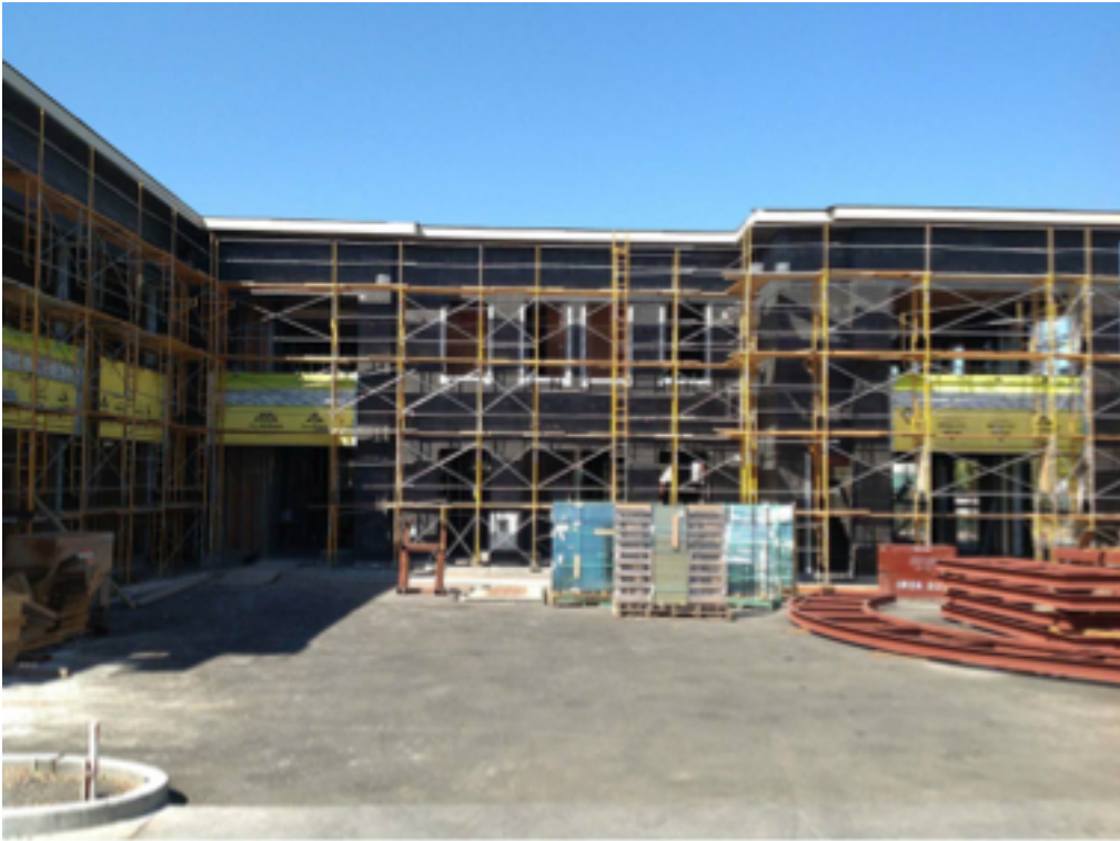
004 Southwest Ext. Elev..Photo 2