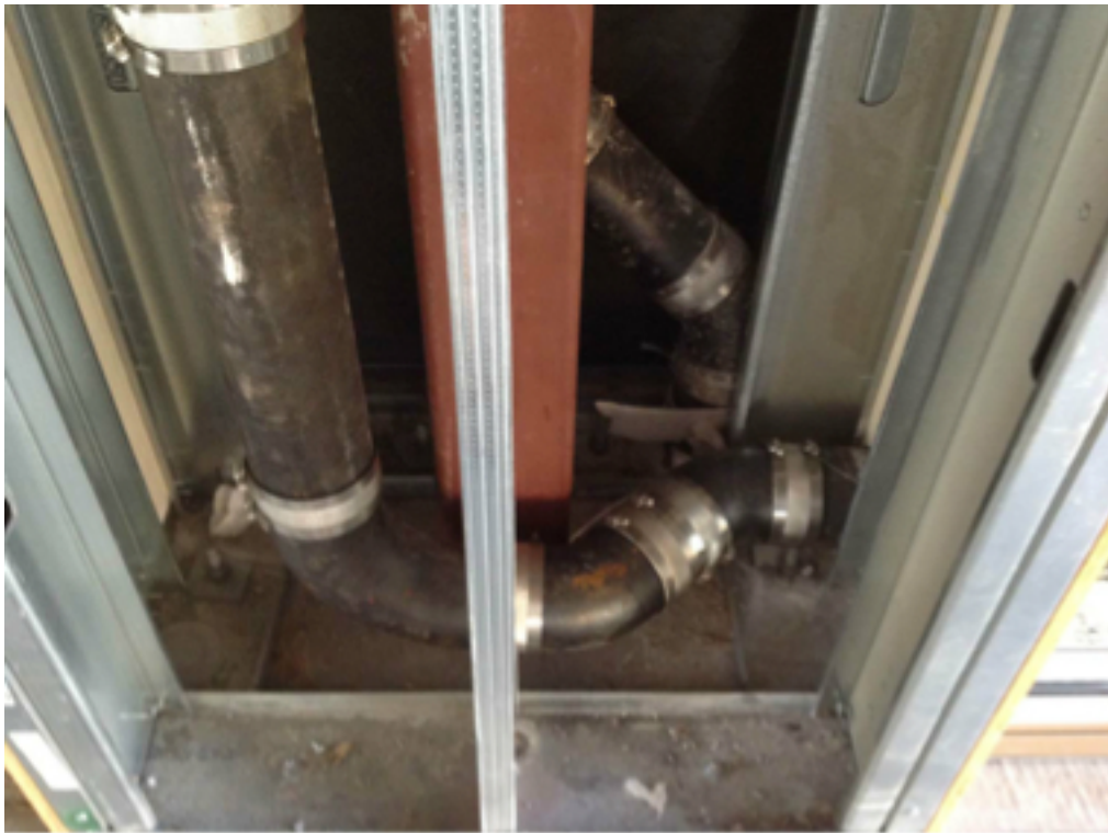
006 Piping at Grid A-6.Photo 1