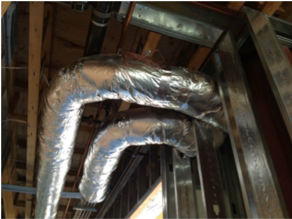
007 Duct Work.Photo 1