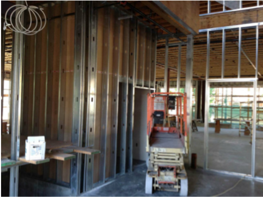
009 Lobby elevator.Photo 2