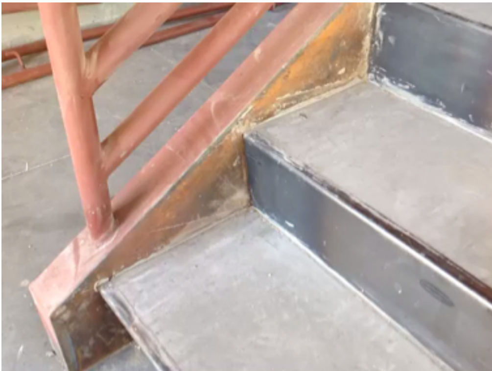
003 Fire Exit Stairs.Video 2