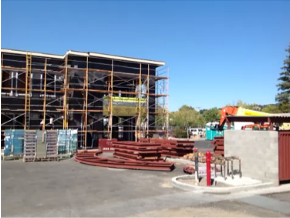
004 Southwest Ext. Elev..Video 1