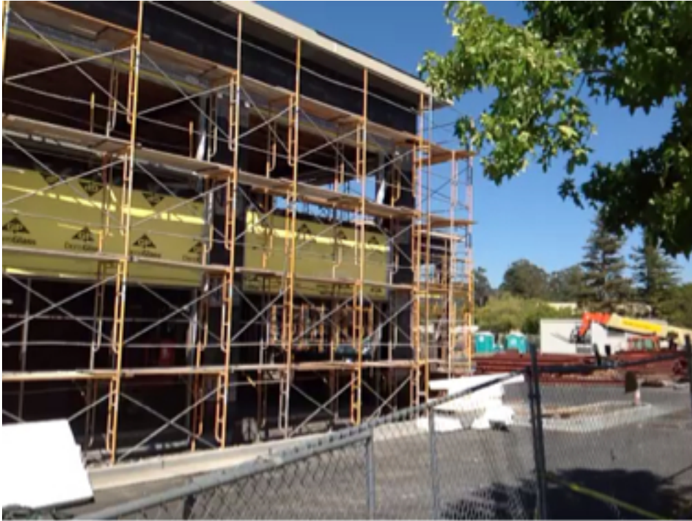
001 Project Example.Video 1