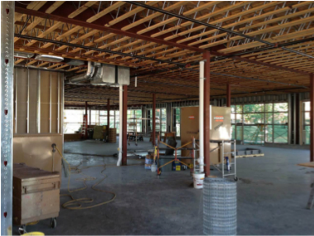
003 Fire Exit Stairs.Photo 2